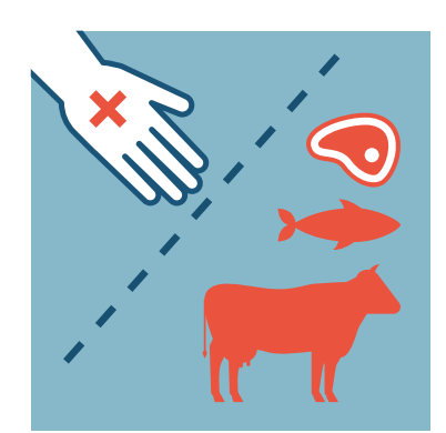
Avoid contact with animals