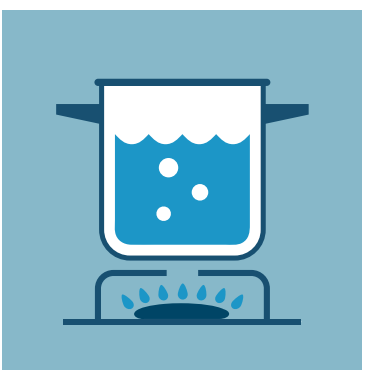
Thoroughly cook meat and eggs