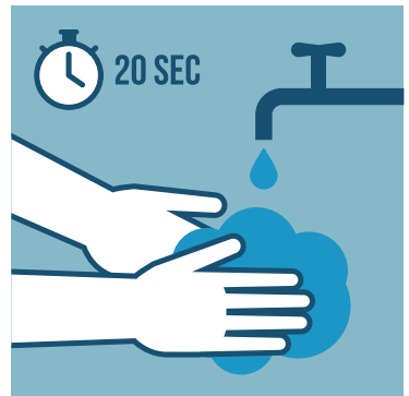
Wash hands at least 20 seconds